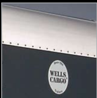
Stainless Steel Front Cap