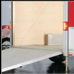
Standard SmartFrame™ Design*