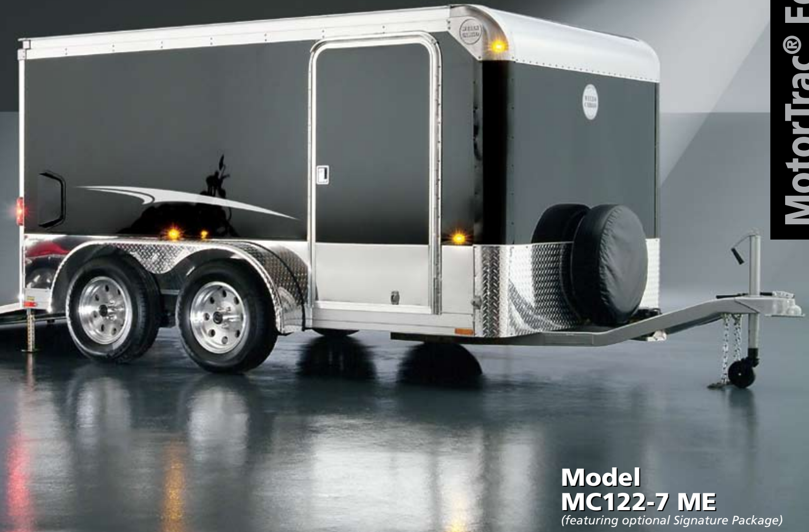
Model MC122-7 ME (featuring optional Signature Package)