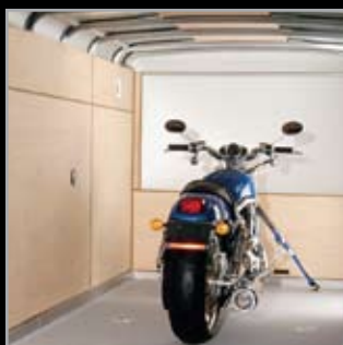
Standard TE Interior