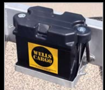
Wet Cell Battery to D.O.T. Standards