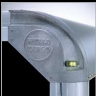
Cast Aluminum Front Cap