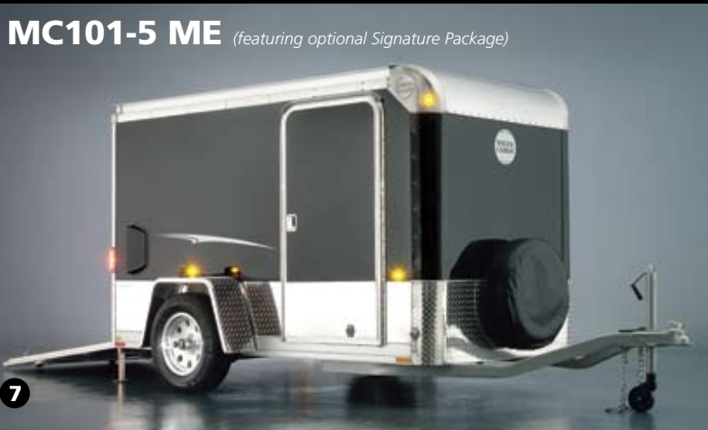
MC101-5 ME (featuring optional Signature Package)