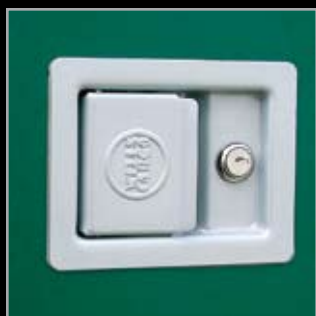
Rotary Style Flush Lock