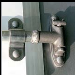
Aluminum Anti-Rack Cam Lock