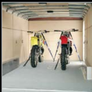
Standard SE Interior