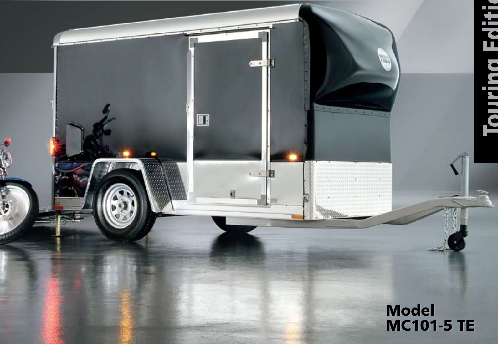
Model MC101-5 TE