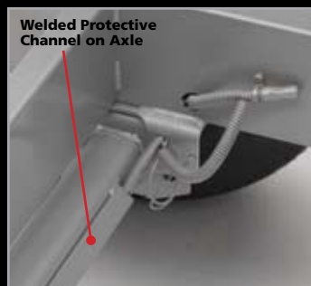
Welded Protective Channel on Axle SmartWire™ Technology (12V)