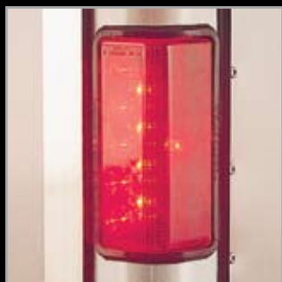
LED Exterior Lighting

Solid engineering delivers solid performance. Even though a motorcycle trailer may be considered a “recreational” trailer by some, the cycleWagon® has the same backbone and rugged heritage as our commercial grade trailers. You can tell by our advanced design, top-notch components, and detailed “fit & finish” that we’re serious about our position as the industry leader. This focus on quality means you’ll run out of adventures long before your cycleWagon® is ready to call it quits.