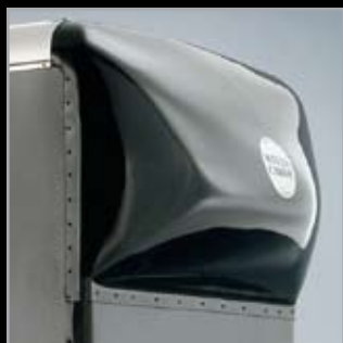
Aerodynamic Nose Cone®

No hassles. This unique blend of form and function makes the TE Series the clear leader of the pack.