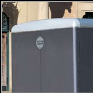
Fiberglass End Caps

Every great adventure has a starting point and the Wells Cargo cycleWagon® SE (Standard Edition) is a smart place to begin your search for a performance driven motorcycle trailer. No bare bones or stripped down version here . . . the SE Series comes well-equipped with everything needed to transport and store your bikes with confidence & style. The SE Series means you never have to compromise or settle for anything less than real Wells Cargo quality.