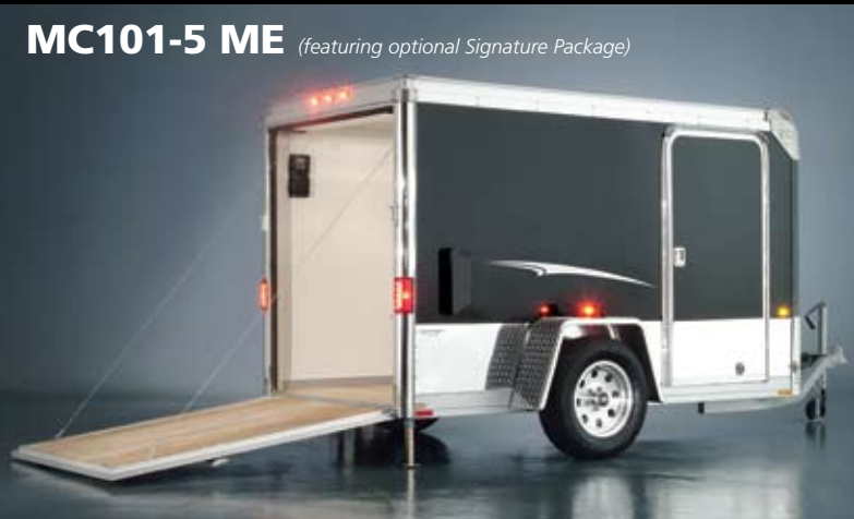
MC101-5 ME (featuring optional Signature Package)