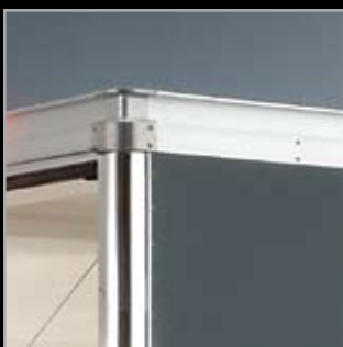
Flat Roof with Extruded Trim