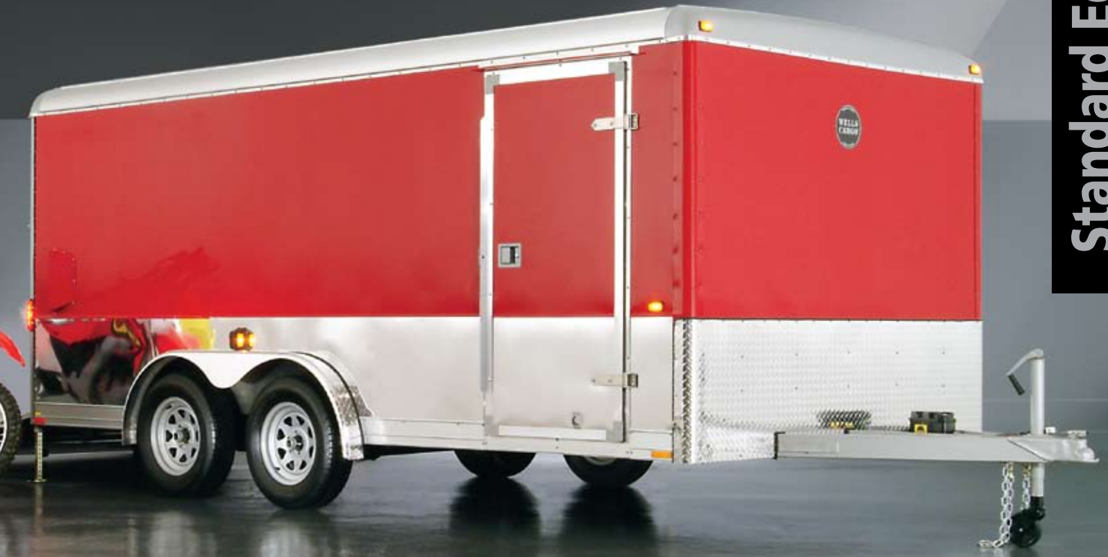
Model MC162-8 SE