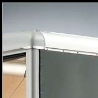
Radius Roof & Extruded Cove