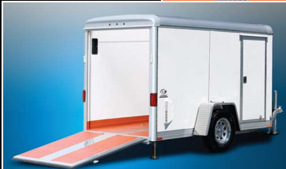
Exterior - Badlands Package